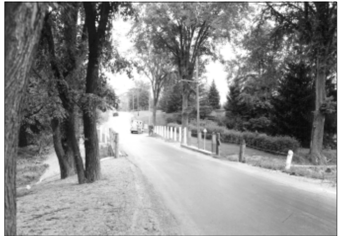
Steeles Avenue West, east of Dufferin Street, 1959, Series 249, File 171

The Archives holds additional North York records, as well as records of the former Met-