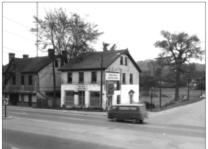
Jolly Miller Hotel (left) and York Mills Skating Rink, Yonge Street, circa 1967, Series 249, File 84