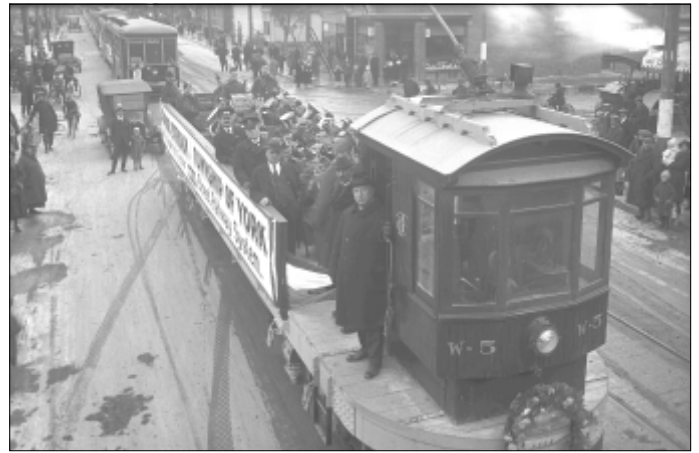
Introduction of streetcar route on Rogers Road, York Township, November 19, 1924, Series 71, Item 3526

Some photographic highlights of York records currently available at the City of Toronto Archives include early airplane flights near Weston (Fonds 1244), the first TTC streetcar in York (Series 71), and views of Weston and York streetscapes in the 1920s (Series 71). Highlights of other media