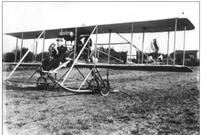
J.A.D. McCurdy in biplane, Weston, 1911, Fonds 1244, Item 78