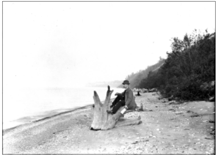
On the beach, Scarborough, circa 1891, SC 128, Subseries 1, Item 1215