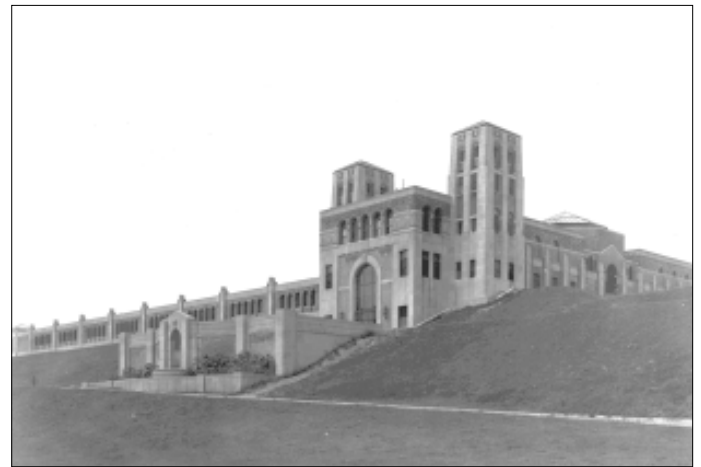
R.C. Harris Water Filtration Plant, 1952, RG 8, Series 72, Item 2033

Barbara Myrvold, The People of Scarborough: A History (Don Mills: City of Scarborough Public Library Board 1997) 971.3541 M99 1997