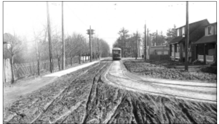
Kingston Road looking south on Victoria Park, April 9, 1923, Series 71, Item 1991

The City of Toronto Archives is easy to get to by public transit. Exit the University subway line at Dupont station and walk north.