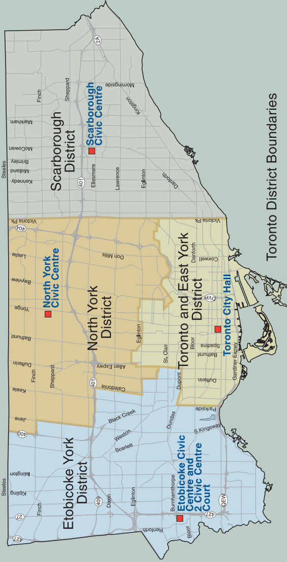
Toronto District Boundaries

Scarborough District Scarborough Civic Centre 150 Borough Drive 3rd Floor Toronto, ON M1P 4N7 416-396-7526