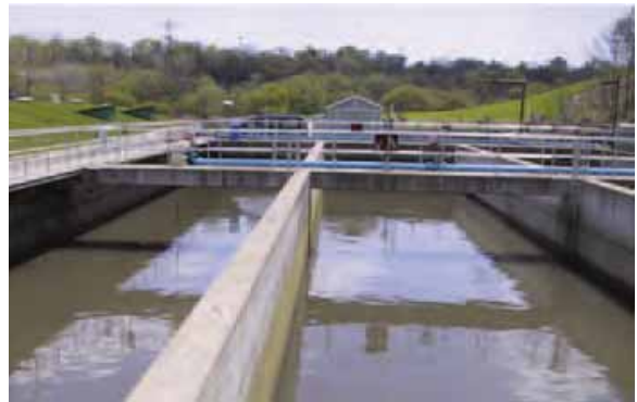
North Toronto Treatment Plant CSO Storage Tank