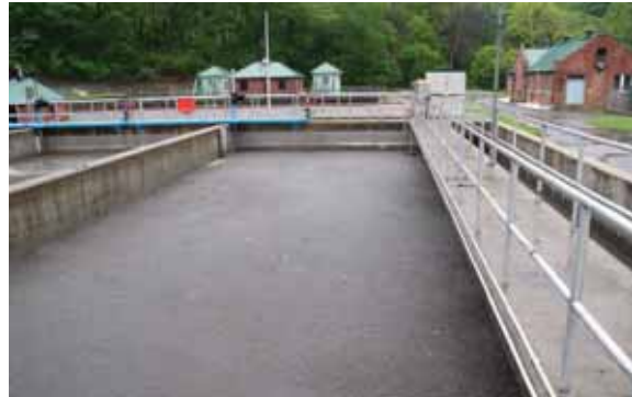
CSO-Storm Tank at NTTP