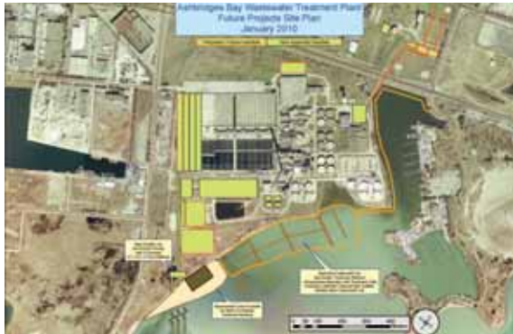
WWF Treatment and CC Wetland