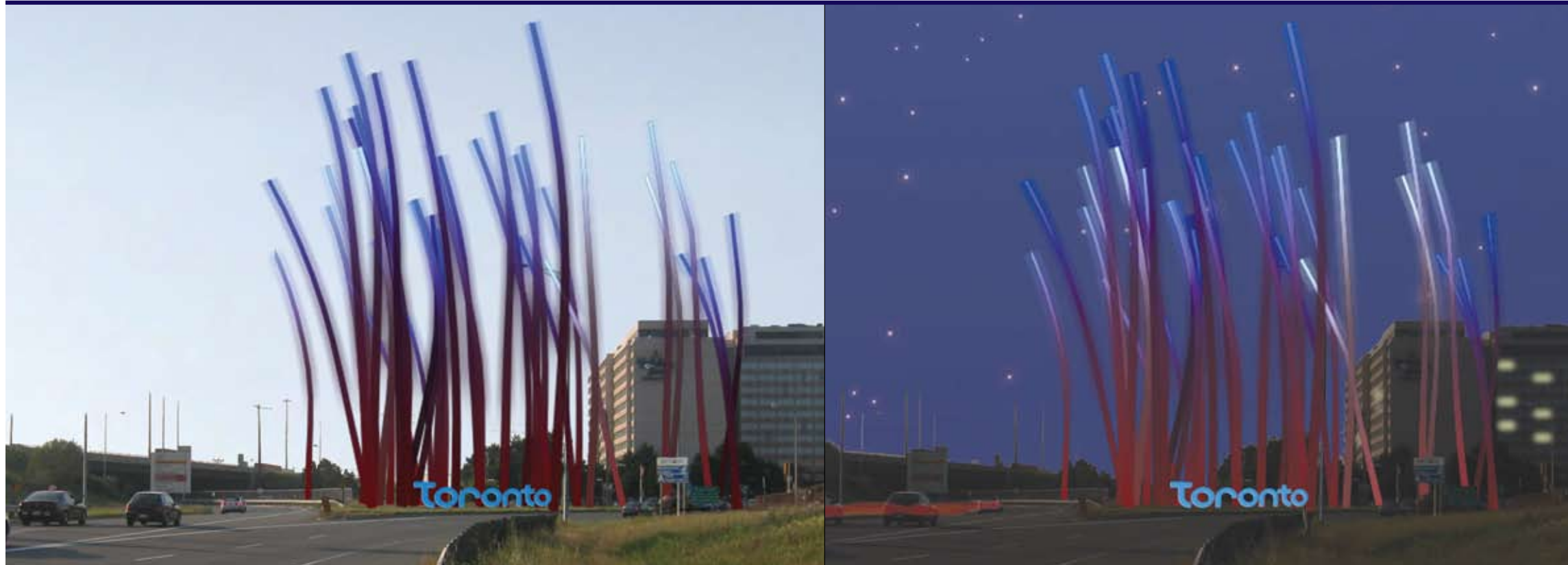
Consultant Team: Sweeney Sterling Finlayson & Co Architects

This design concept is the preferred alternative from a two phase study which included community consultation. The project will require future fundraising and public-private partnerships to be built.